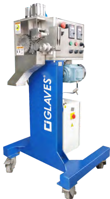
GCD-50 TRIM CUTTER

Input Material PP, HDPE, LLDPE, PC, PVC, PET Film